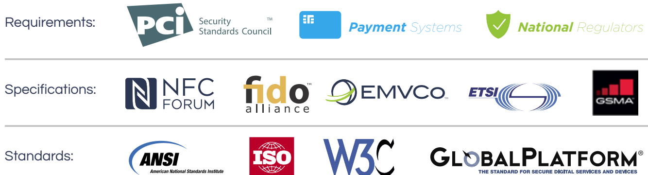
Figure 4: EMVCo works with several technical bodies to ensure alignment